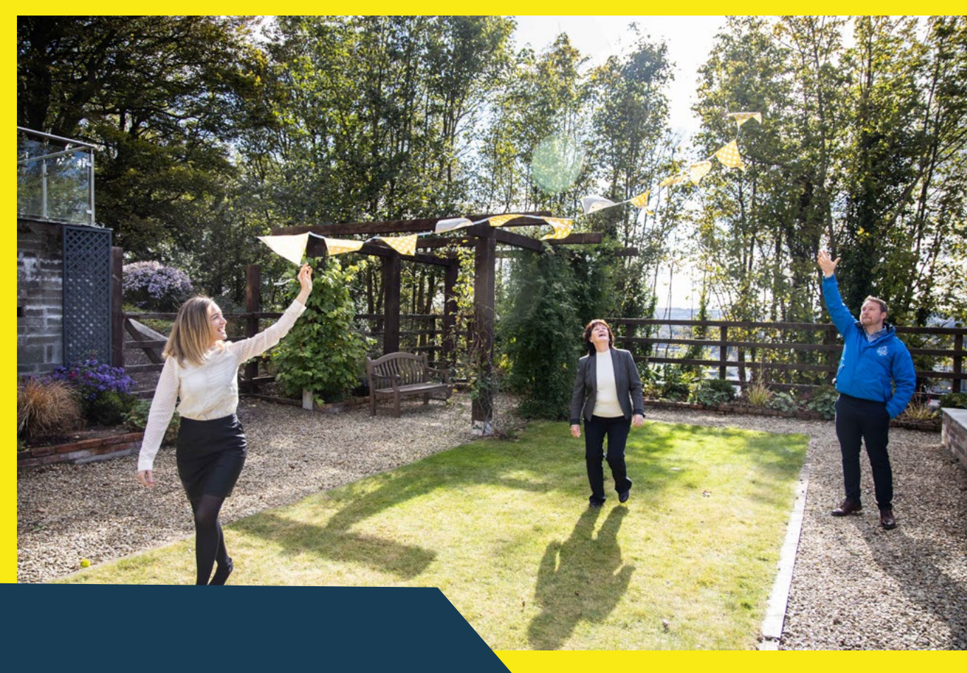
Caption: The Sustainable Cork Fund Awardees