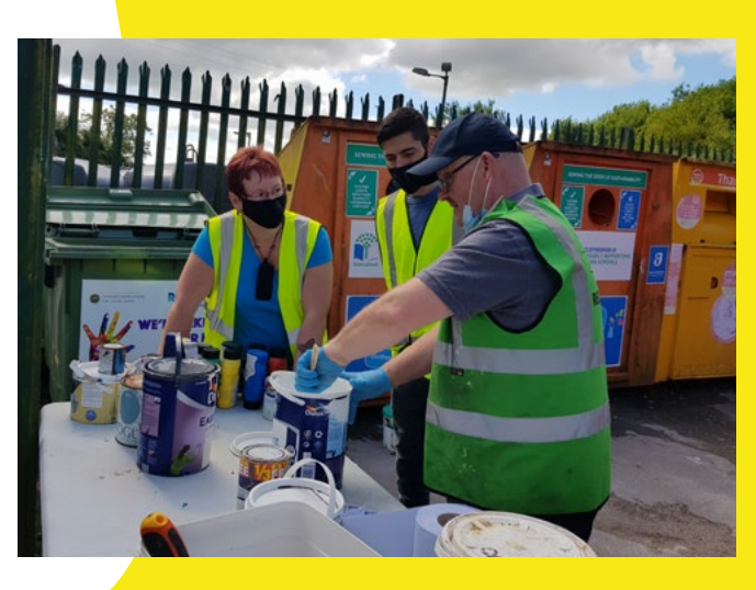
Caption: NCE Outreach

"First and foremost, the time spent [with NCE Outreach] was rewarding on many fronts. However, I must state, as persons, new into recovery, our thinking and behaviours, [when we initially engaged with NCE Outreach], is not the same as it is, later on, down the road. It takes time to get back physically, cognitively, and emotionally. It would be a disservice to self and those that have helped us on this journey, not to include spiritually, too. For those people that do stay in recovery, the time in a structured environment such as NCE is paramount in creating a space for self-discipline, which can facilitate personal growth. For those that don't stay in recovery, at the very least it sows a seed back to reality, and this will hopefully grow, the sooner the better. I can only speak for myself when I say I wasn't keen on being at Farranferris at the beginning, but with time, as the head settled and the mind stopped racing, I started to see the benefits of the modules, not as a way to a goal of certification, but as an exercise in self-discipline and a positive use of time, the journey, not the destination, living in the now and being present."