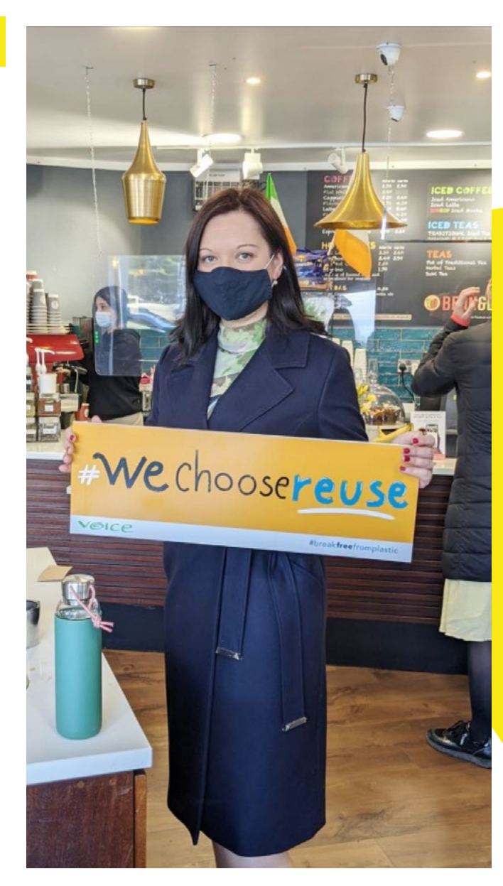
Caption: Refill Ireland